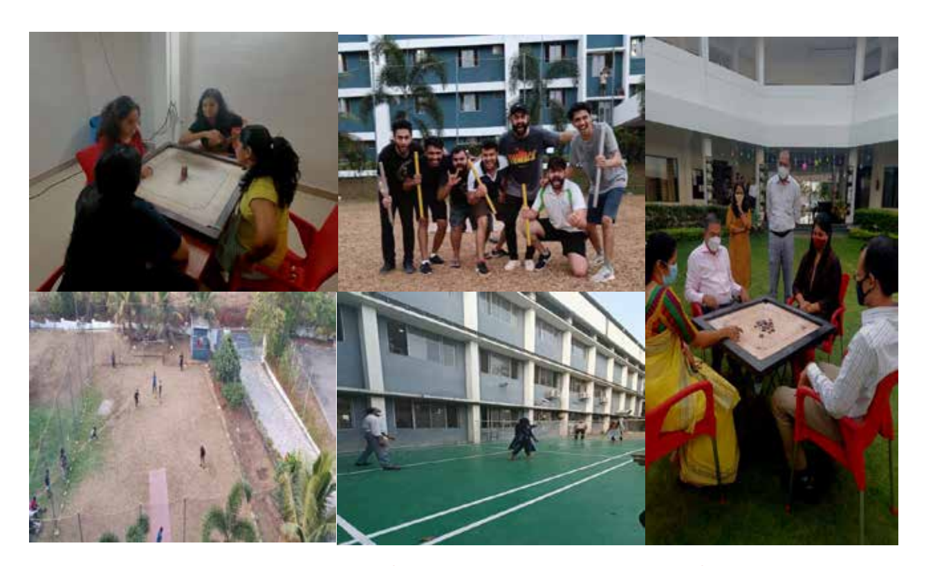
Students and faculty enjoying matches as part of XSL