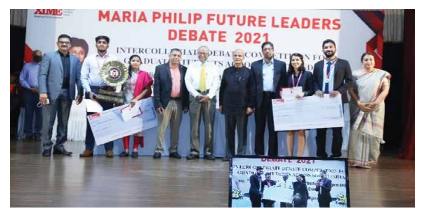
The winning (left) and runner up team (right) with the prizes