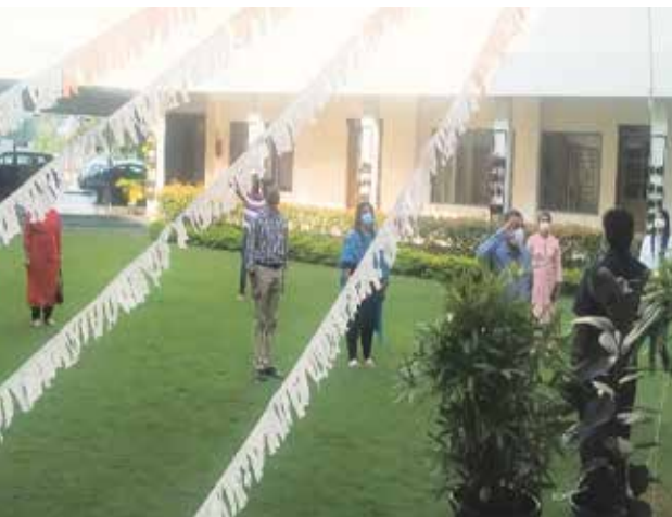
Republic Day Celebration, XIME Kochi- January 26, 2022