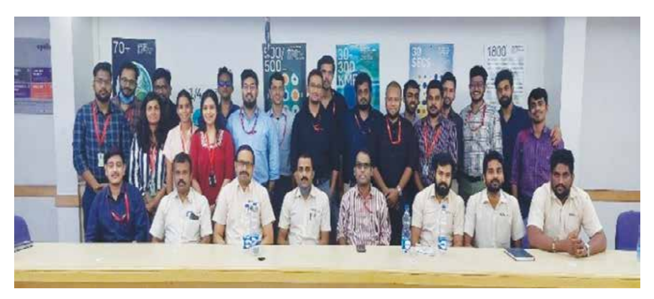
XIME Kochi team at Apollo Tyres Ltd., Perambra Plant, Thrissur, Kerala

part in those discussions and even provided a few suggestions, particularly regarding the adoption of modern technology to further optimize the system.