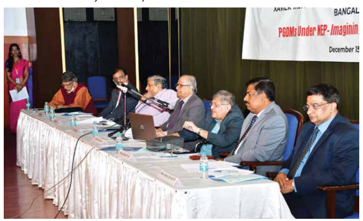
Dignitaries at the Regional Conference

The conclave was followed by a workshop on PGDM in the NEP context.